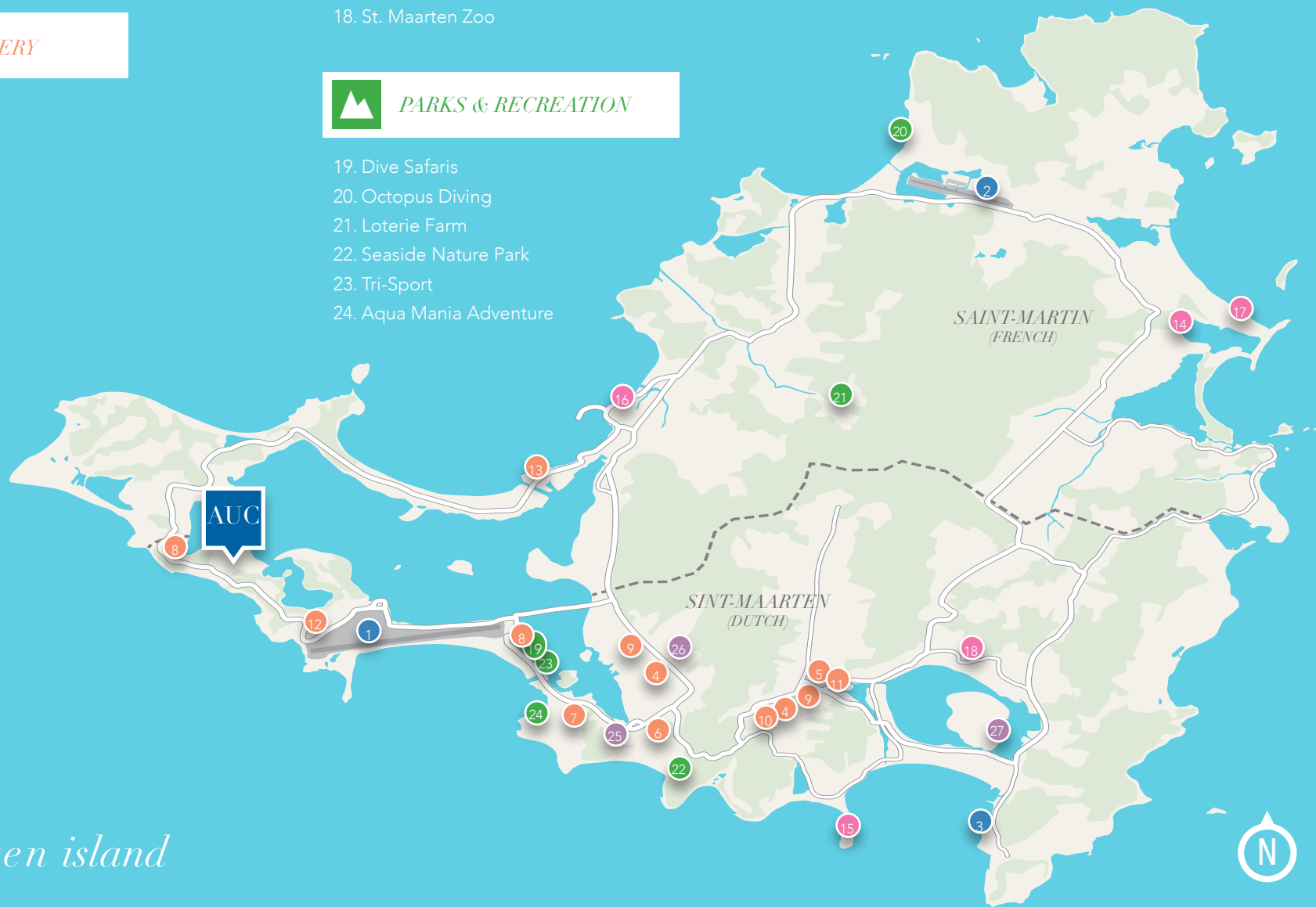
Sint Maarten island